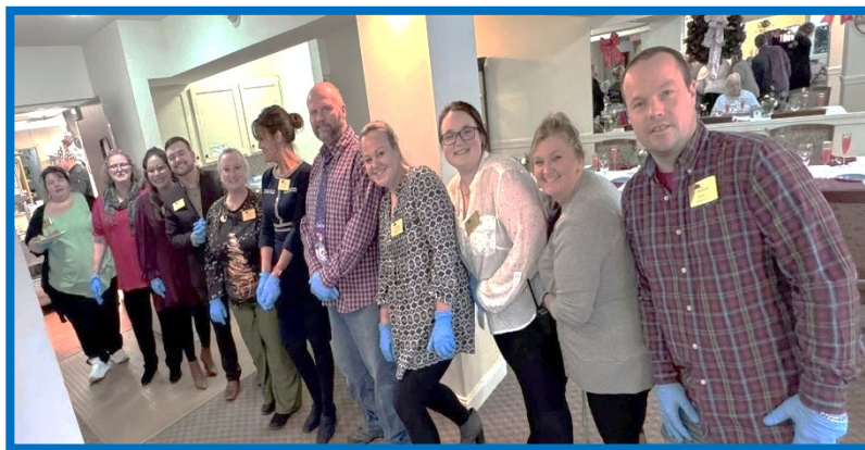
Wardwell Staff Ready to Serve Christmas Dinner!