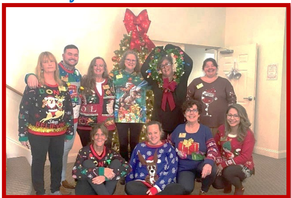
Wardwell Staff in Christmas Sweaters!