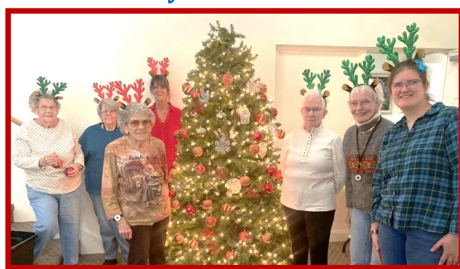
Christmas Decorating One of Many Trees!