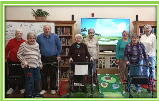
Golf Tourney Time